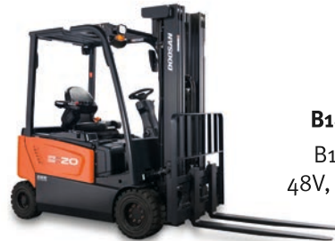
B18X-7 Series B16/18/20X-7 48V, 4 Wheel truck