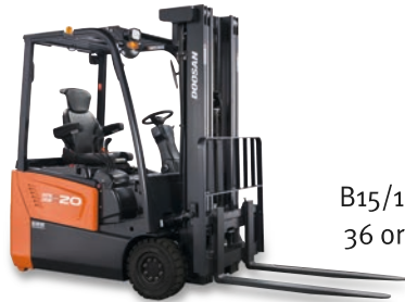
B18T-7 Series B15/18/20T-7, B18/20TL-7 36 or 48V 3 Wheel Truck