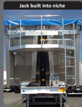
Jack built into niche

Limits the retention of the retention of product for tipping and encourages run-off.