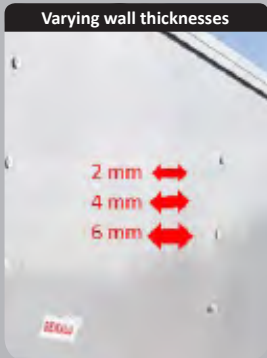
Varying wall thicknesses

Internal part of the wall of varying thicknesses so as to respond ideally to each type of load.