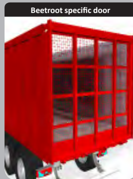
Beetroot specific door

Innovative door, specifically design to transport beetroot.