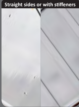
Straight sides or with stiffeners

Straight sides or with stiffeners for improved weight or visual appeal.