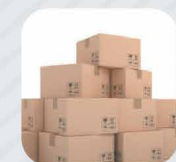
Parcel & Courier

VE COMMERCIAL VEHICLES A VOLVO GROUP AND EICHER MOTORS JOINT VENTURE eichertrucksandbuses.com, Eicher Care: 1800 102 3531