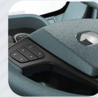
Steering mounted controls