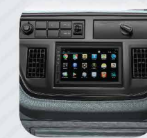
18cm touchscreen infotainment system