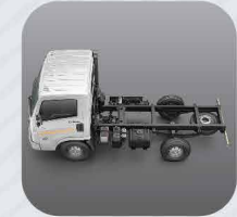
CED coated rust resistant, sturdier & rugged BSK46 chassis